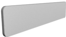
Loop plastic trim